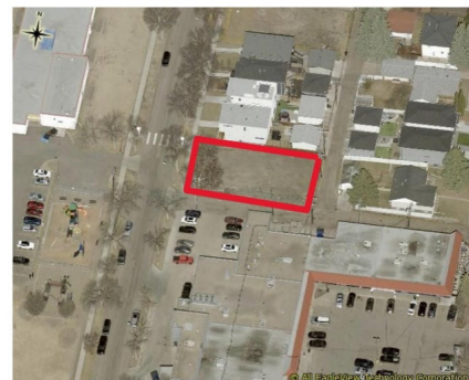
9115 143 St-Location