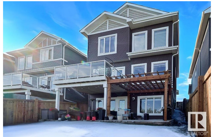
880 Ebbers Cres NW, Edmonton, AB